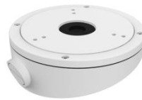
DS-1281ZJ-M Inclined Ceiling Mount